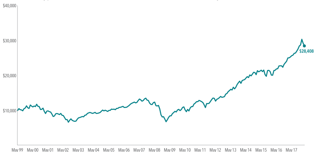
Exhibit 1. Hypothetical Growth of Wealth in the S&P 500 Index, May 1999–March 2018

© 2018 S&P Dow Jones Indices LLC, a division of S&P Global. All rights reserved. Not representative of an actual investment. Indices are not available for direct investment; therefore, their performance does not reflect the expenses associated with the management of an actual portfolio.